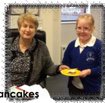
Mr Wolf's Pancakes

Pupils produced an assembly titled "Material World" which was enjoyed by the rest of the school